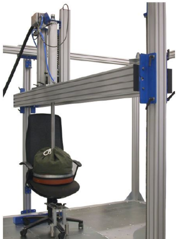
Drop tester for installation into the test field