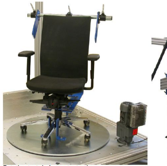
Rotation test rig for caster testing